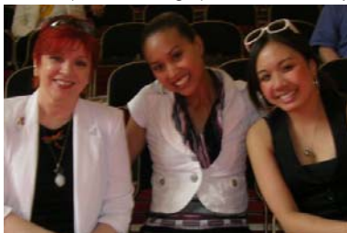
Photos (below and right) from FYP-DC-Sponsored Kennedy Center event (May 2007)