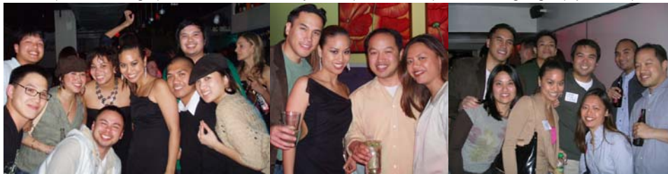
Photos (from left to right) from FYP-DC Birthday Bash (March 2007) and Bowling Night (April 2007)