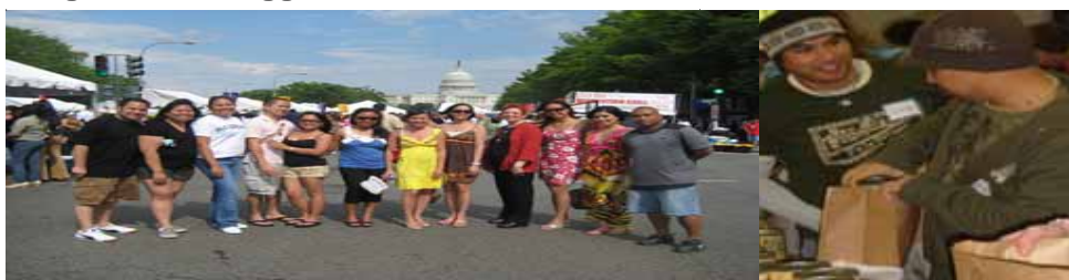
Filipino Young Professionals Washington, DC

So please take care of that ASAP. Plus, you wouldn't want anyone to call you kuripot, diba? ☺