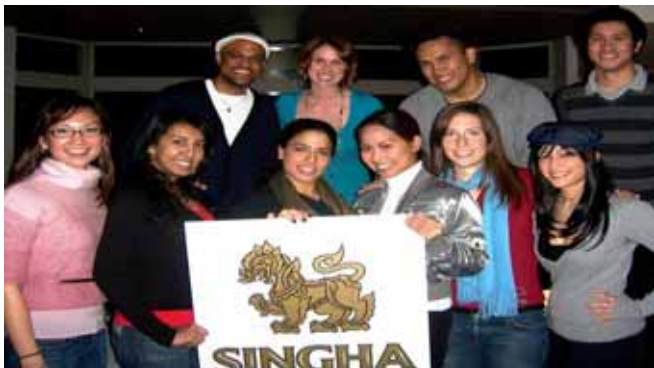
Filipino Young Professionals Washington, DC